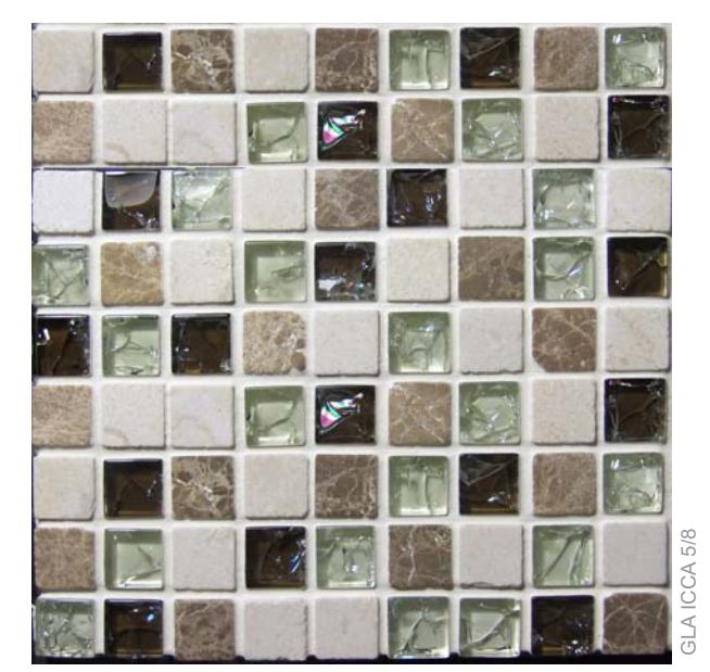
| caffe |